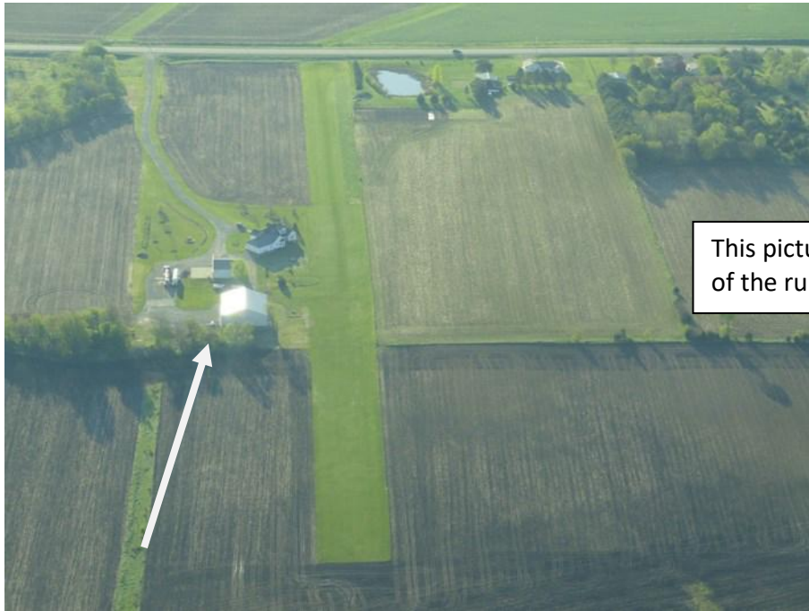
This picture is from the west end of the runway looking east.