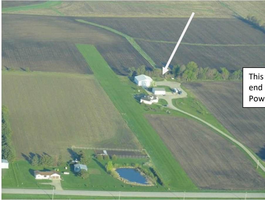
This picture is from the east end looking west. (Notice: Power lines along the road)